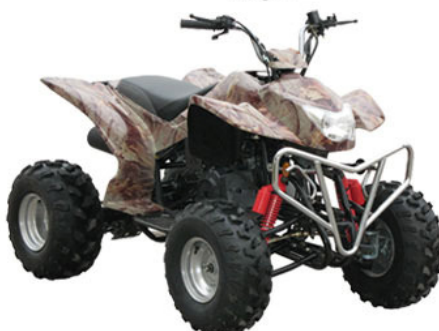
Yellow maple leaf