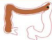
5-10分钟，脾曲以下清洁