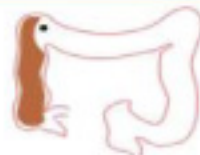
10-20分钟，肝曲以下清洁