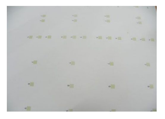
1.Special tool calibration nozzle