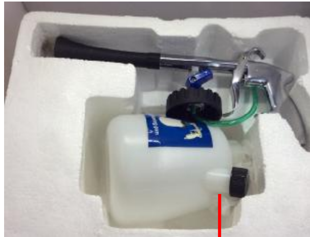
1pc brush head+1pc tornado guide

2pcs Tornado Guide: 1pc assembly in the gun; and 1pc reserve; It is double operational life span (working life of the gun);