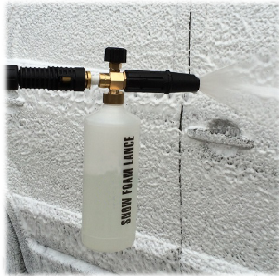
BT-7001 Foam Lance