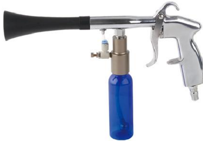
BT-7005 Paint Gun for Nano Paint Crystal (coating)