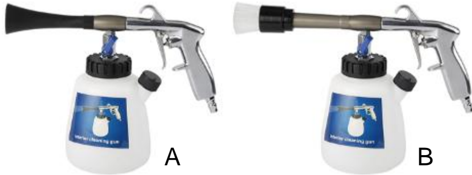
A: High Quality Plastic Splay of the Gun Head B: High Quality Brush for of the Gun Head

BT-7002 Change the connector for different functions; 1 set = 2 Gun Heads + 1 bottle + 1 Gun + 2pcs Tornado Guide;