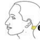
Nape of Neck

Size: 1 _____ 2 _____ 3 _____ 4 _____ 5 _____ 6 _____