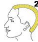
Forehead to Nape