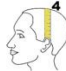
Ear to ear over top