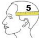
Temple to temple round back