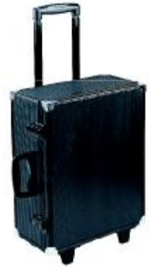
JHC-C006 456x305x107mm 5100CD片装