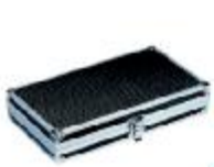
JHC-C001 275x150x55mm 45CD片装