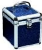
JHC-C002 166x190x107mm 100CD片装