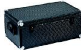
JHC-C005 456x208x107mm 518CD片装