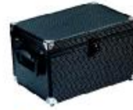
JHC-C004 307x208x107mm 248CD片装