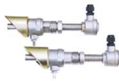
C-type (oblique insertion)