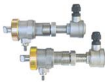
B-type (direct insertion)

If the pipe material is carbon steel or stainless steel can be installed directly welding, but if the pipe material is cast iron, FRP, PVC or cement please contact with the manufacturer to order the dedicated pipe hoop. To prevent leak water please give the exact outside diameter or perimeter to the manufacturer.