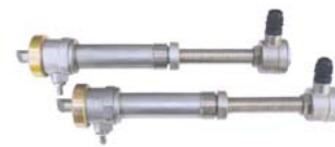
B long-type (cement insertion)