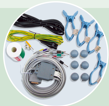
■ Standard Accessory