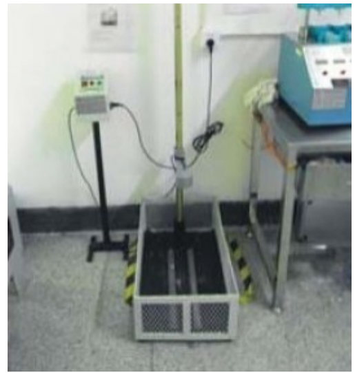
Vibration Impact Meter