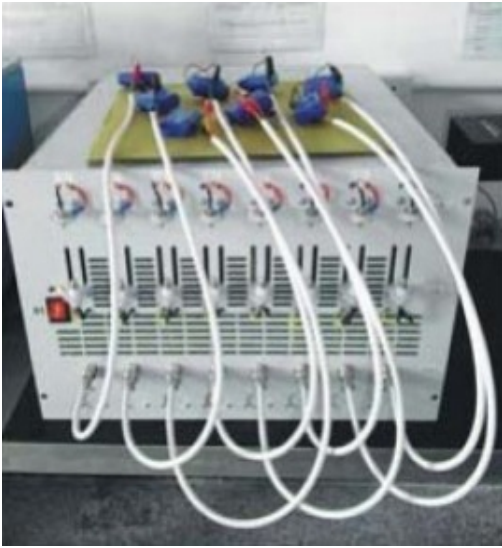
Battery Life Testing Machine