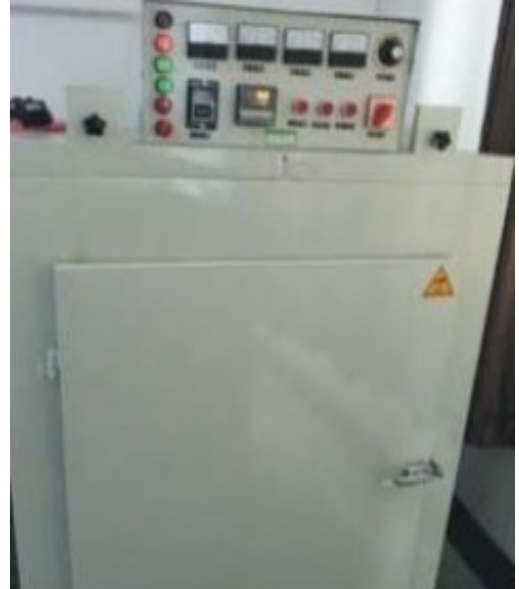
High Temperature Testing Machine