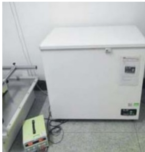
Low Temperature Testing Machine