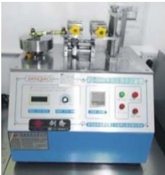
Plug Life Testing Machine