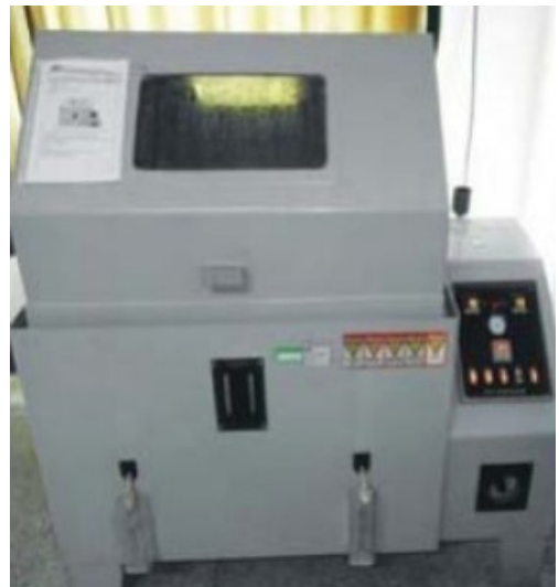
Salt Spray Testing Machine