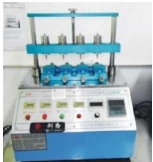
Switch Testing Machine