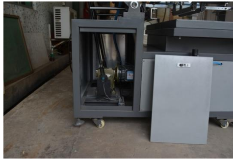
Right side of the machine and the fan, the first single solenoid valve