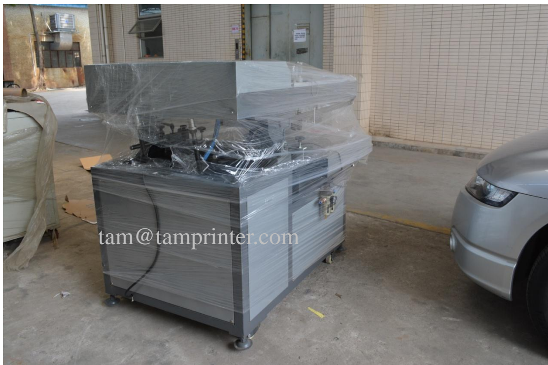
Front and Operation Panel