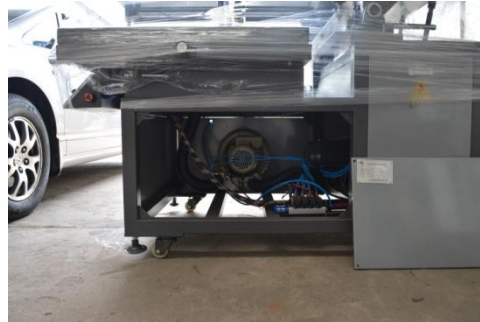
Right side of the machine and the circuit board