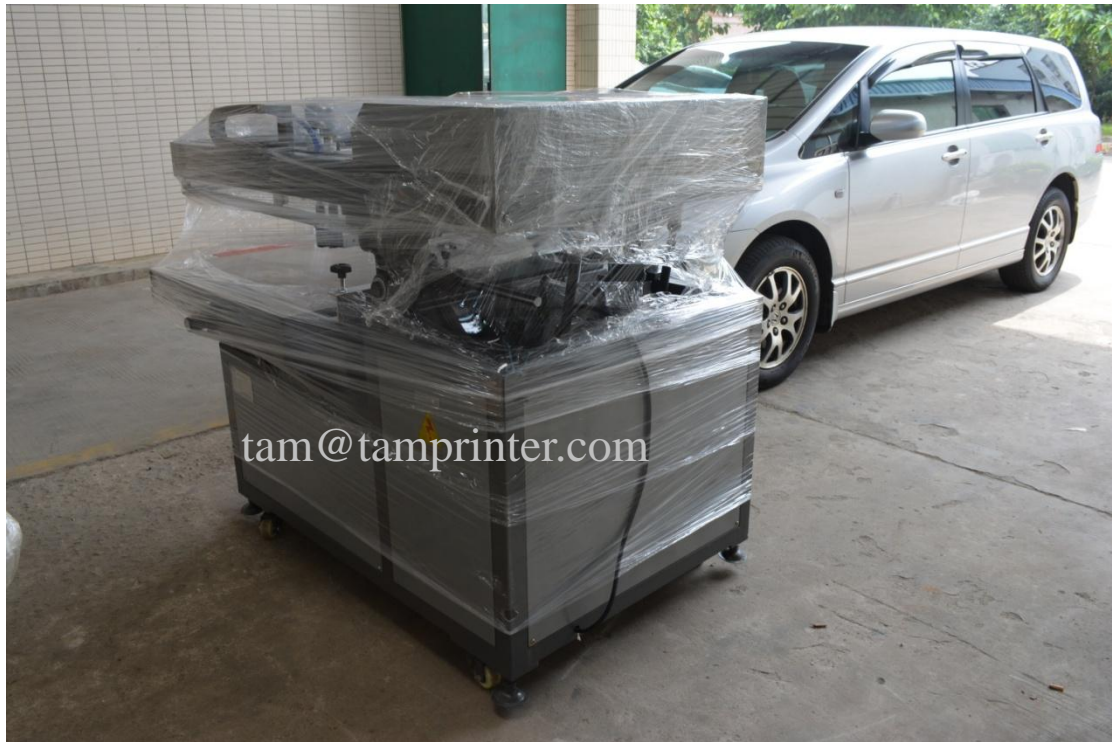
Back left corner