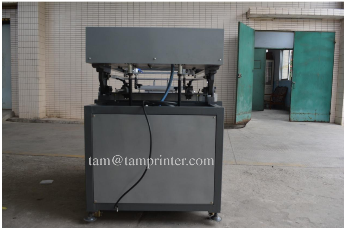
Back right corner