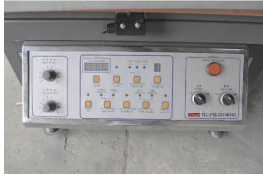
Front of the machine and safety board