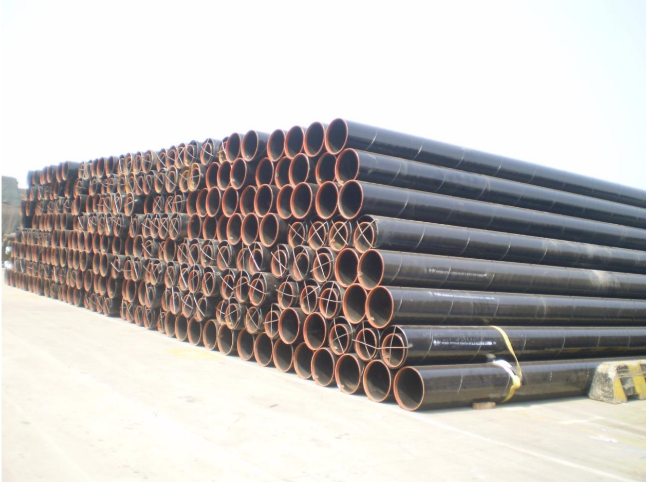
Metals End Protectors with Steel Cross Section