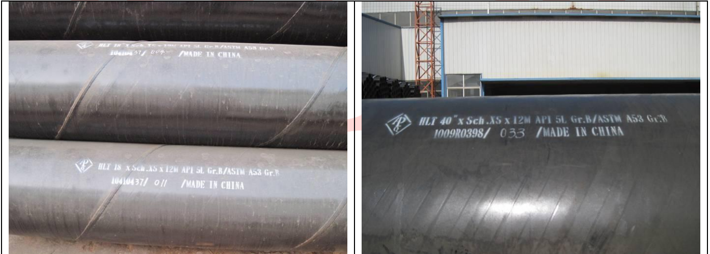
Marking and Shipping mark