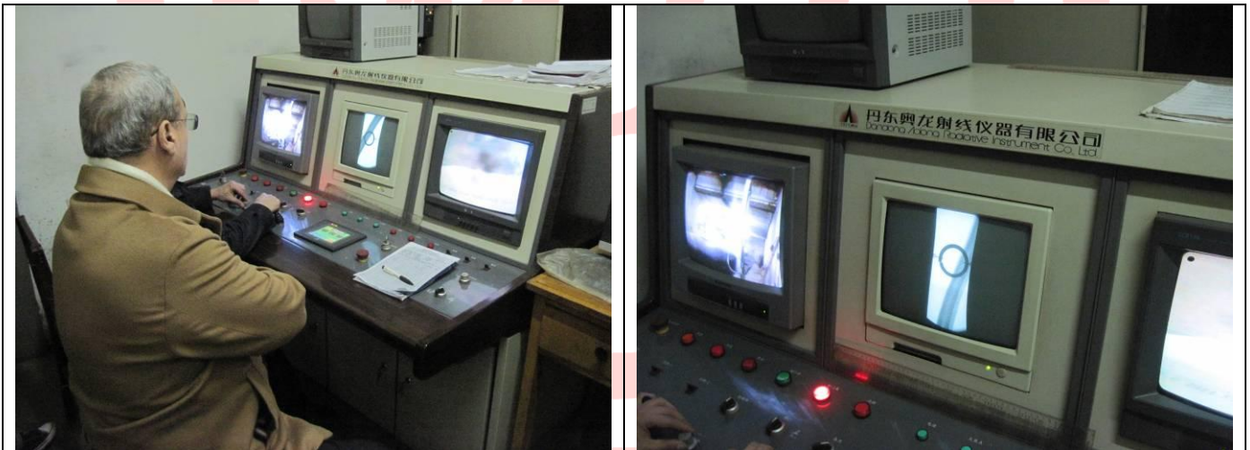
Verifying X-ray Test

The customer had verified X-ray Test, and 4pcs of pipes ( one for each size ) were all passed. Photo attachment as below