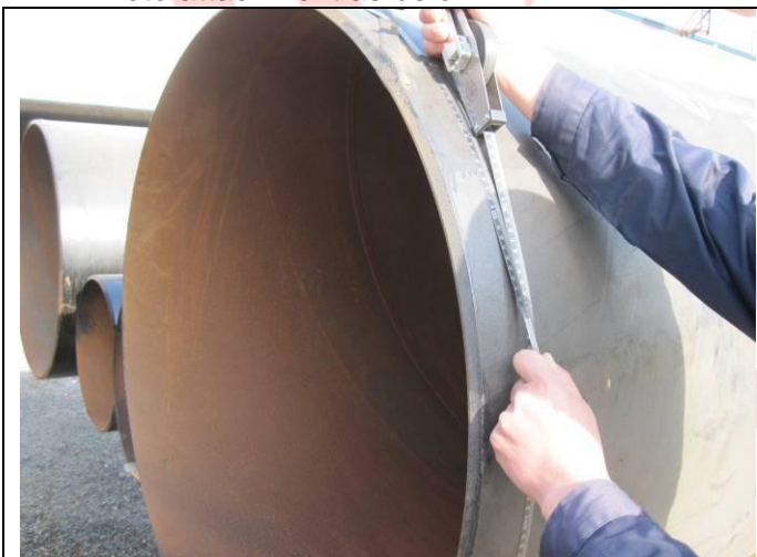
Measuring OD of pipe end