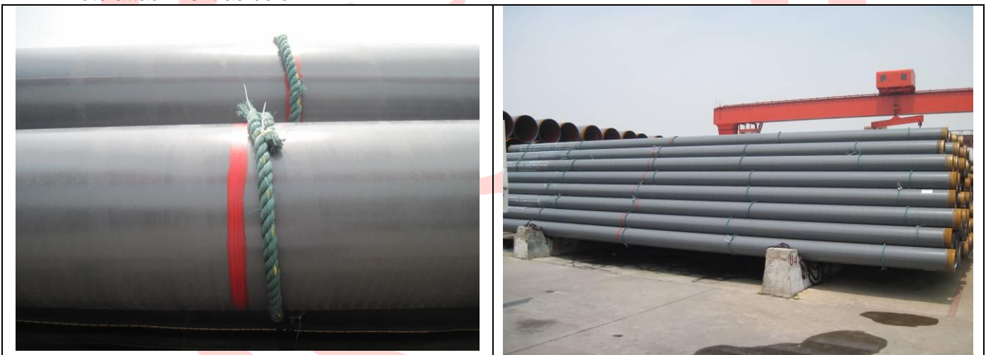
Round Color Band per thickness