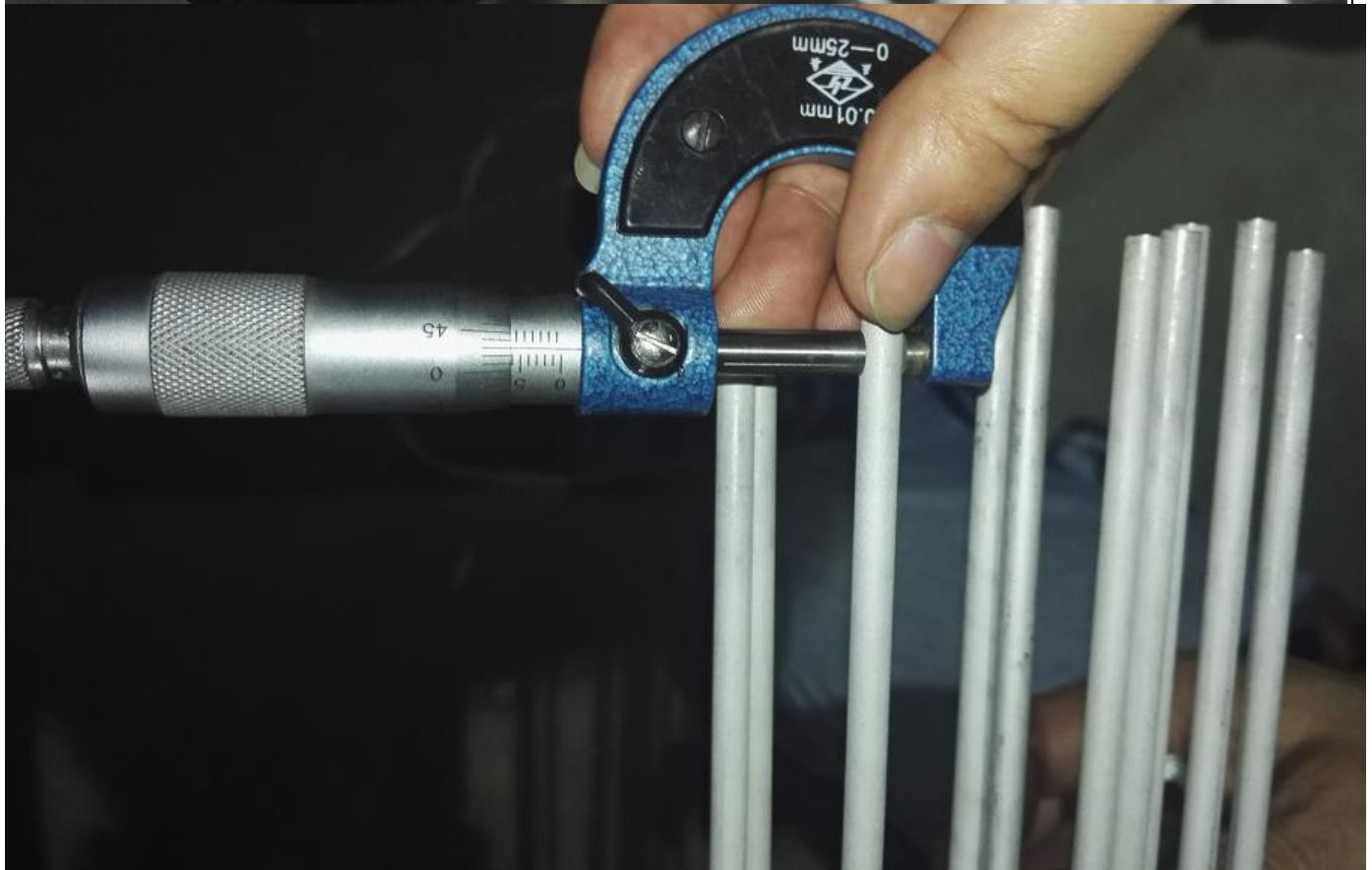
Measuring OD of tube end