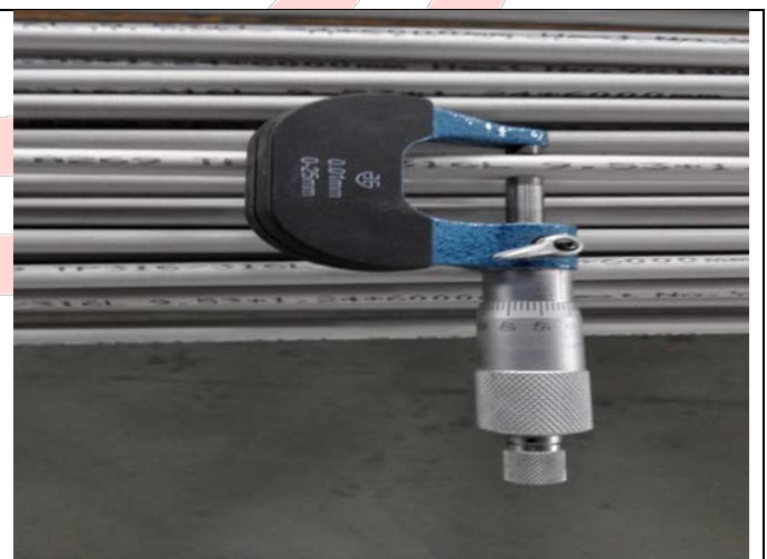
Measuring OD of tube body