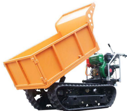
mini crawler type truck dumper 1000KG (palm garden transporter)