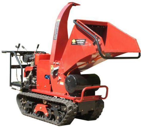
Crawler type wood shredder