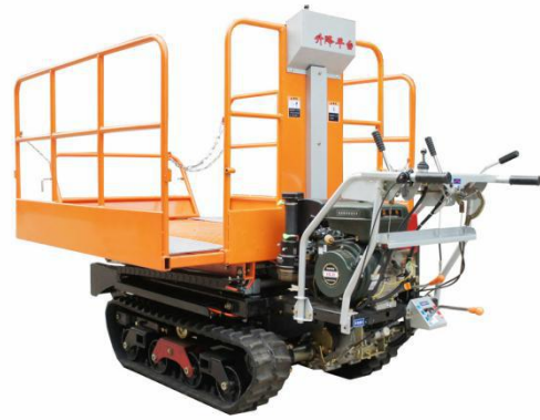
Crawler type garden work platform