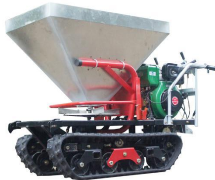
Mini crawler type hydraulic motor drive fertilizer spreader