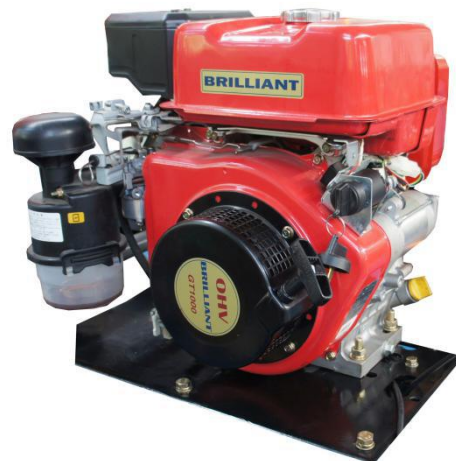
Mitsubishi gasoline engine 10 HP

We can provide power matching standards according to customer needs.