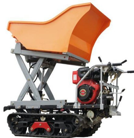
mini crawler type truck dumper with lift container