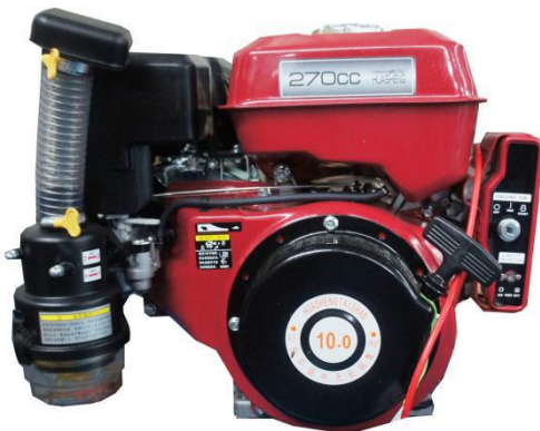
Huasheng gas engine 10HP