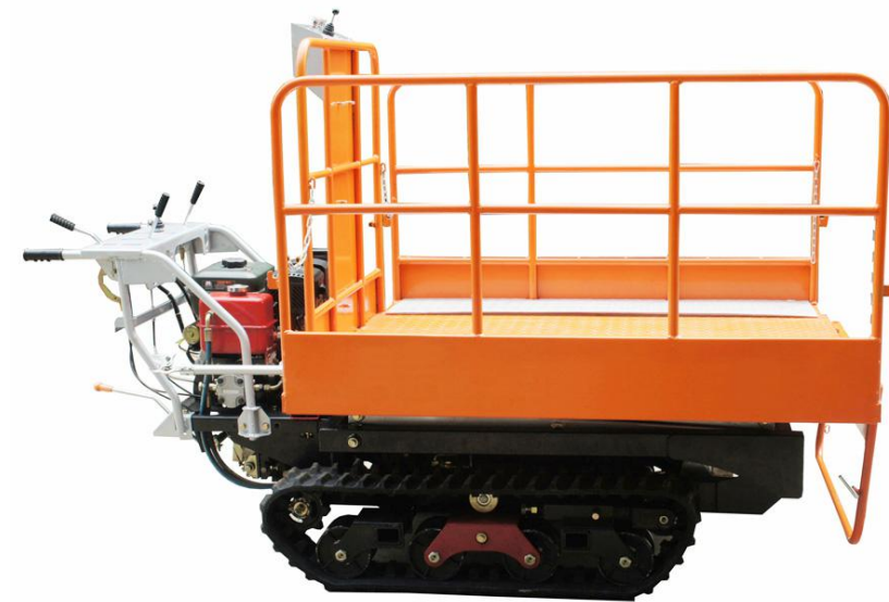
Right Side Main picture ( www.walijixie.com ).