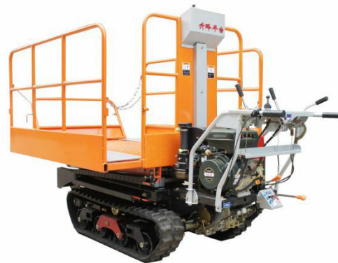
Crawler type garden work platform