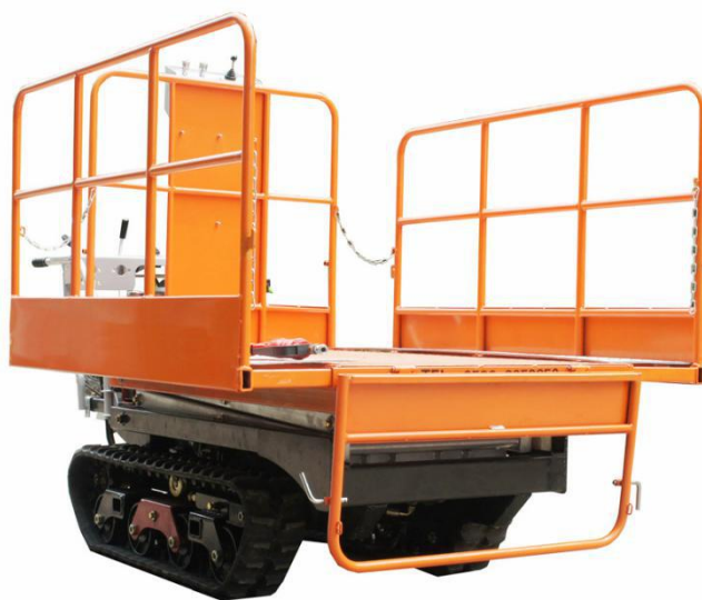
Right front Main picture (Email: walijixie@126.com )