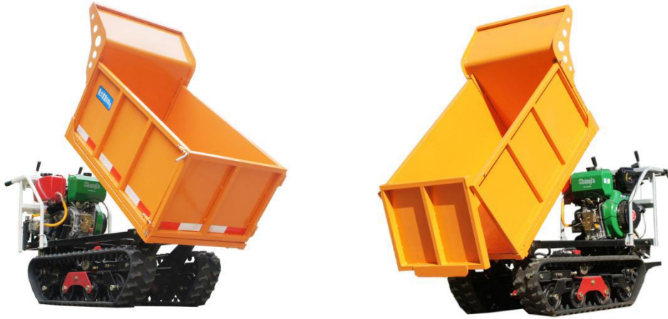
mini crawler type truck dumper 500KG