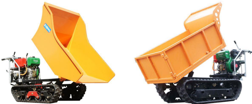
mini crawler type truck dumper 1000KG (palm garden transporter)