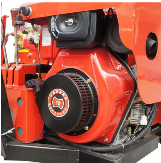
Changchai diesel engine 12HP