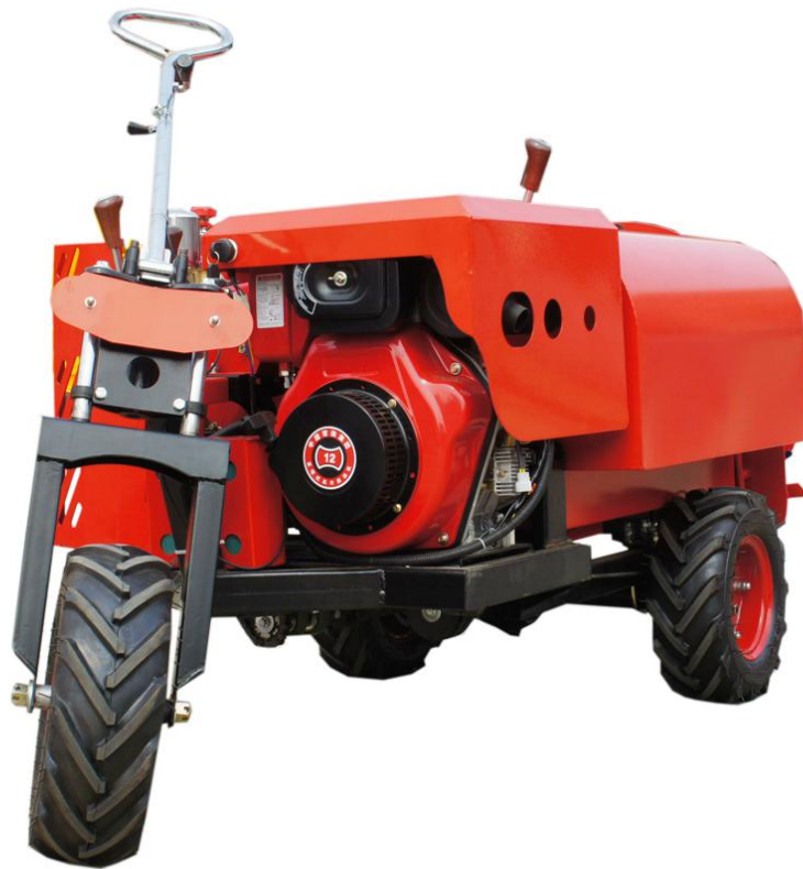
Main pictures 3WZ-250A

The whole machine is shorter and narrower, and has high traffic ability.