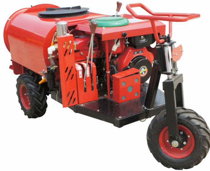
Main pictures 3WZ-250B