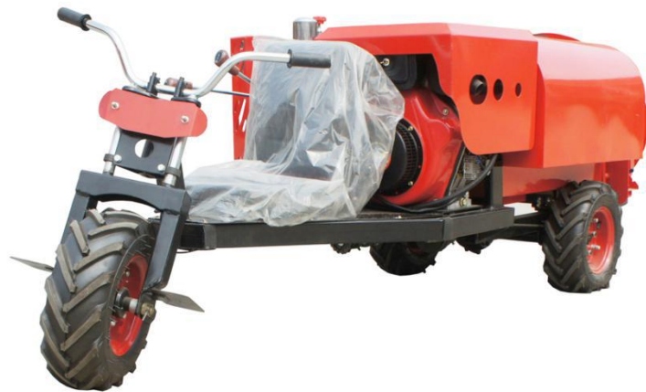
Main pictures 3WZ-250C