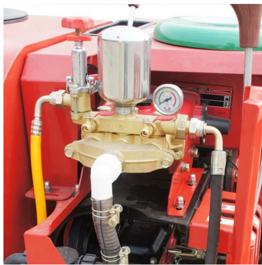
Three-cylinder plunger pump