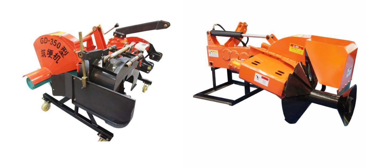
Single side riding making machine for rice paddy field.