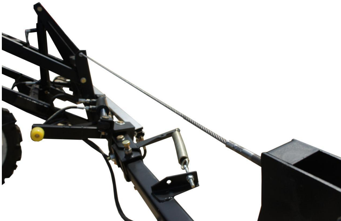
Boom body configuration the Collision avoidance device.