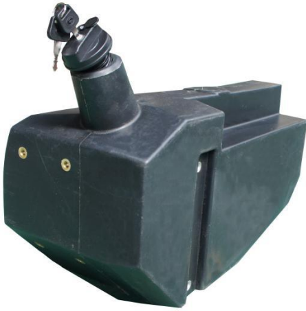
The PE material Fuel tank with key.