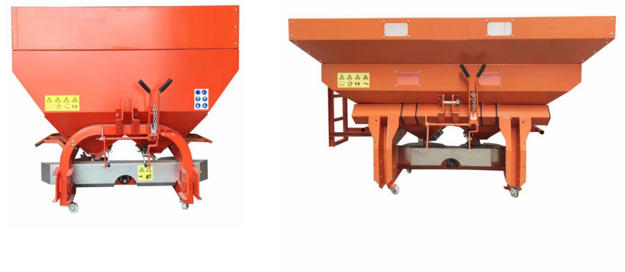
Tractor mounted type fertilizer spreader (1000-2000 L)