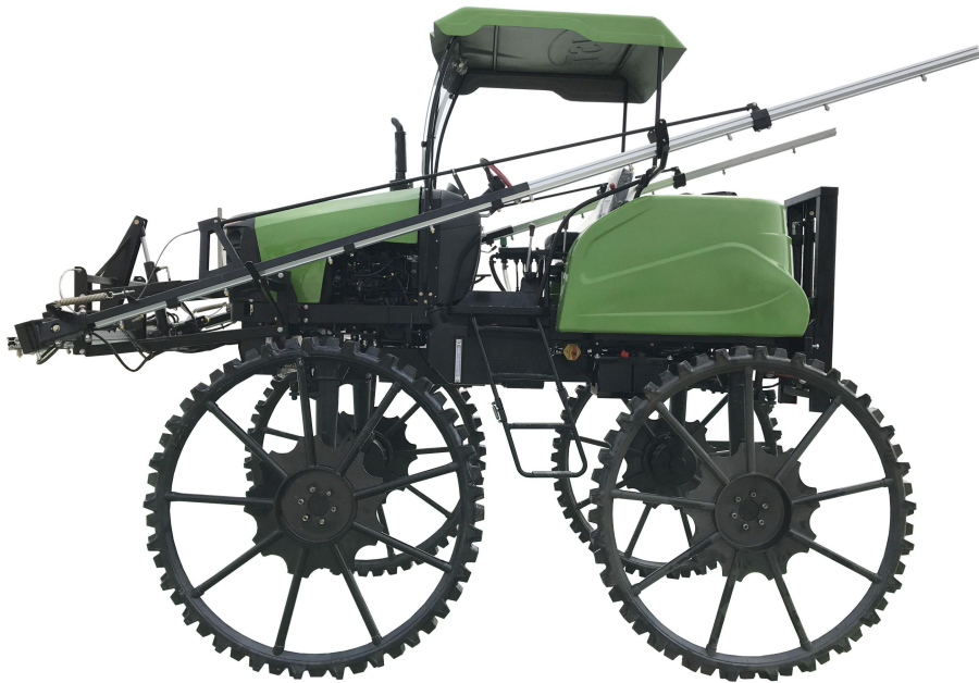
Right Front Main pictures.