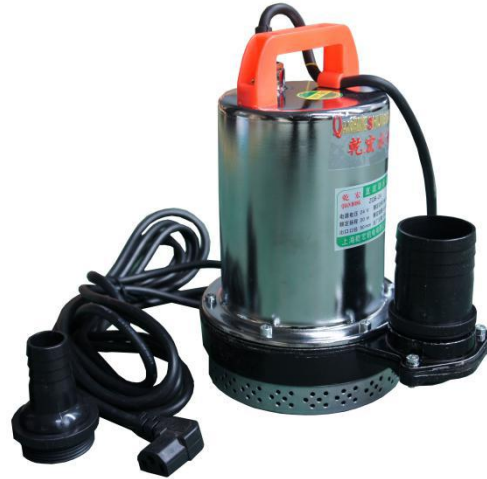
Electric water pump.