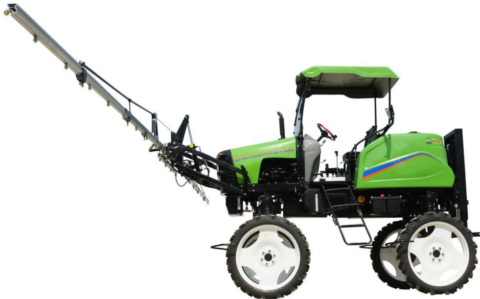
Left Front Main pictures