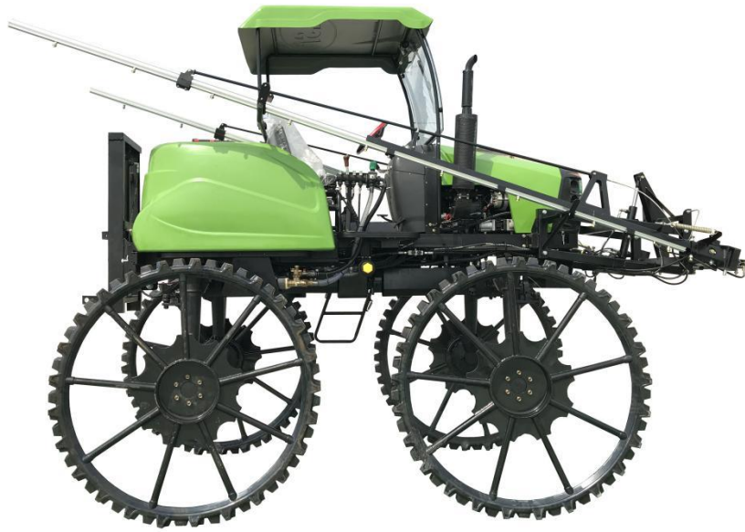
Right side Main pictures