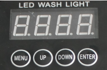
Front display panel