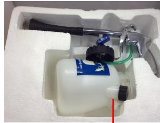
1pc brush head+1pc tornado guide

2pcs Tornado Guide: 1pc assembly in the gun; and 1pc reserve; It is double operational life span (working life of the gun);