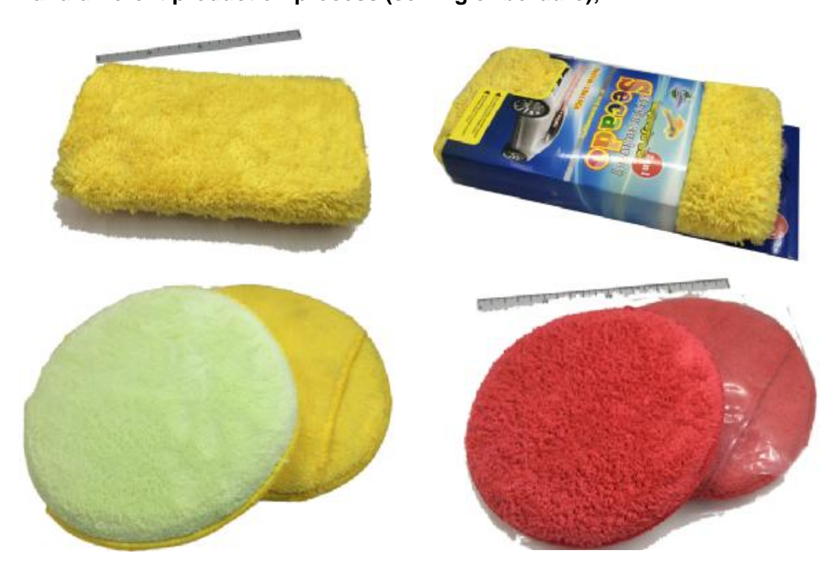
www.brilliatech.com Professional team for car care and washing

BT- 6019 Microfiber Washing Pad (wax applicator): support: any size, any color; and different production process (sewing or bordure);