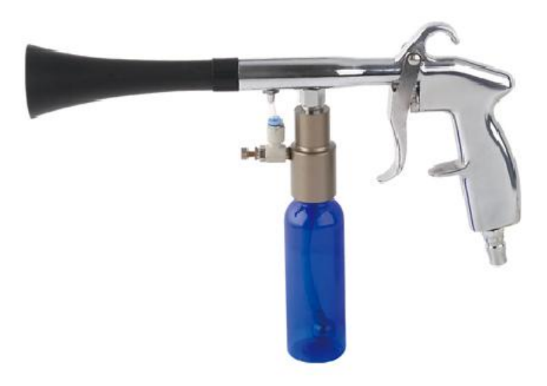
BT-7005 Paint Gun for Nano Paint Crystal (coating)