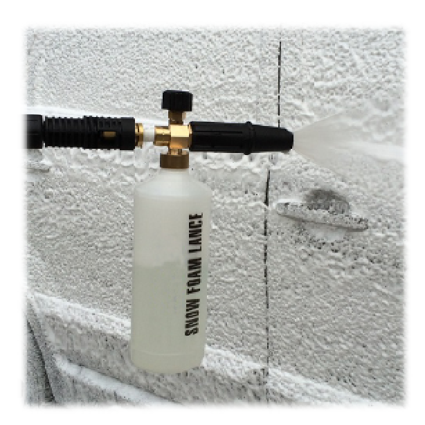
BT-7001 Foam Lance