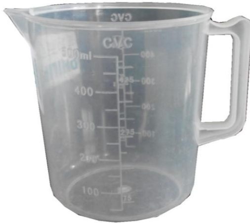
5.5g Plastics gratuity cup

1. 先取一个干净的塑胶量杯,最好有刻度的,将称好的矽胶、矽油搅拌均匀后静置。 (想知道每个胶头用料多少,可用胶头模装满水称重即可)。