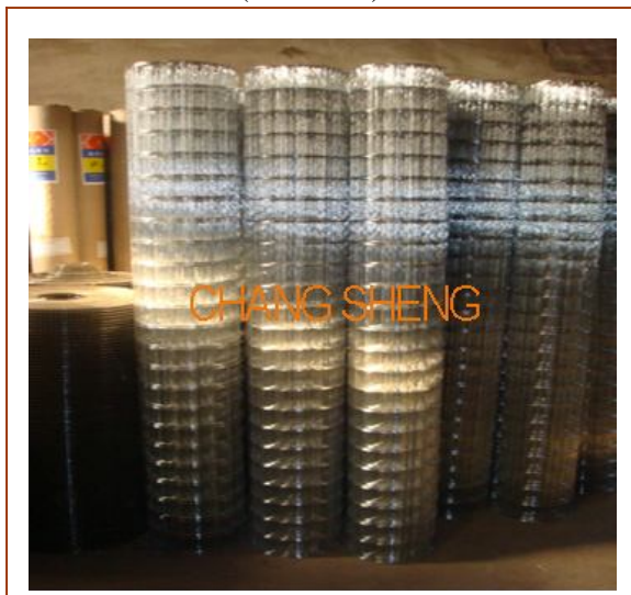
Welded mesh (plaster wall mesh) BM-03

Material: galvanizing plate, SS plate Plate thk: 0.3mm, 0.35mm, 0.45mm, 0.5mm, etc Open: 2 i , 4 i Width: 65mm, 75mm, 100mm etc Length: 50m, etc Packing: 60 coils/box, 80coil/box, pallet.