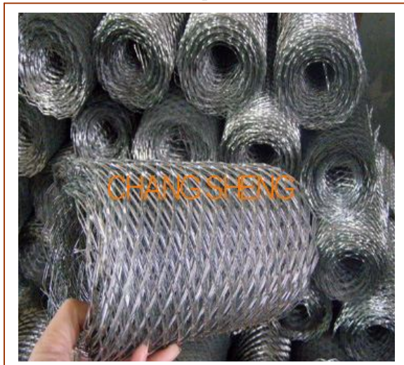
Brick Mesh (coil Mesh) BM-02

Material: galvanizing plate Plate Thk: 0.3mm, 0.35mm, 0.45mm, 0.5mm, etc Open: 16 X38MM, 19 x 38mm etc Width: 65mm, 100mm, 150mm, 200mm etc Length: 1.2m, 1.22m Packing: 500/box, 1000pcs/box, pallet.