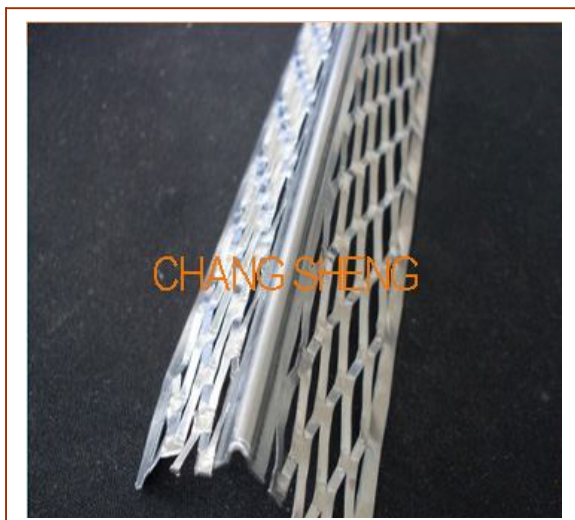
Angle Bead BM-06

Material: galvanized Plate Plate Thk: 0.5mm etc Rib Depth: 12mm etc Width: 166mm etc Length: 800mm, 1000mm, 1900mm etc Packing: Pallet