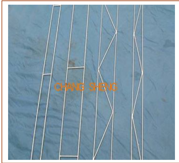
Ladder Mesh BM-07

Material: Steel bar, galvanized iron wire Wire Dia: 4mm etc Width: 100mm, 150mm, 200mm, 27mm etc Length: 2m, 2.5m, 3m etc Packing: Pallet