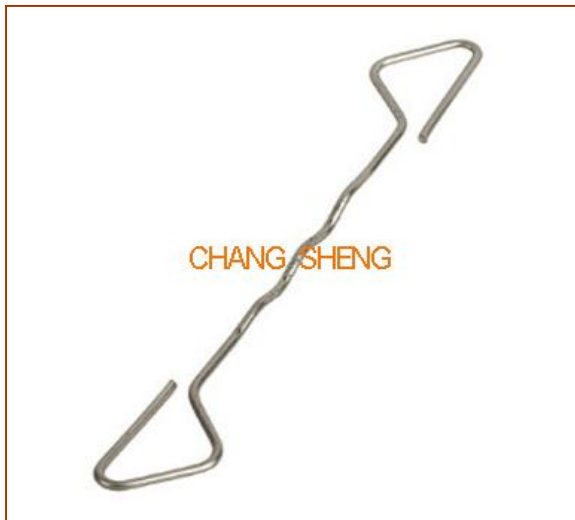
Wall Tie BM-08

Material: Steel bar, galvanized iron wire Wire Dia: 4mm etc Width: 100mm, 150mm, 200mm, 27mm etc Length: 2m, 2.5m, 3m etc Packing: Pallet